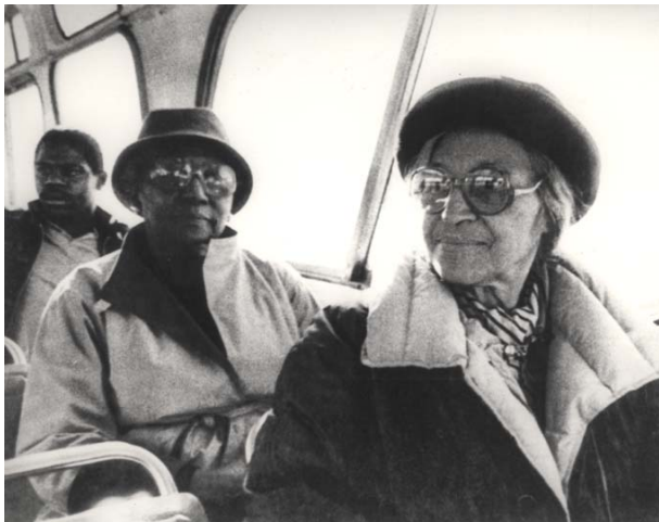
Boycott: End protest after set time